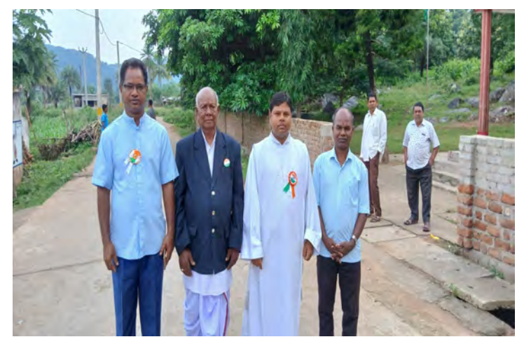
8. AWARENESS PROGRAMME IN ALL VILLAGES FOR CHILDREN AND YOUTH